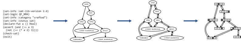
Figure 1: The steps conducted during the creation of the input graph from a given SMT formula.